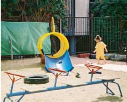
Equipment donated by SAP to an autistic kindergarten in Israel.