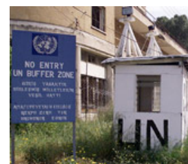
UN Blue Line on the Lebanon-Israel border, near Kiryat Shmona

The young people may be religious or secular, from the city or the country, Israeli born kibbutzniks or new immigrants or from the Arab sector, but together they spend two weeks working alongside scientists on authentic projects such as cancer research and medical plant genetics.