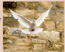
Dove at the Western Wall. Tisha B'Av recalls the hope of redemption even in the midst of trouble.

During August the Jewish people enter a period of three weeks of mourning which culminates as a day of fasting on the 9th of the Hebrew month of Av - known as Tisha B'Av. On this day the book of Lamentations is read to remember the destruction of both temples and many other calamities that have happened to the Jewish people.